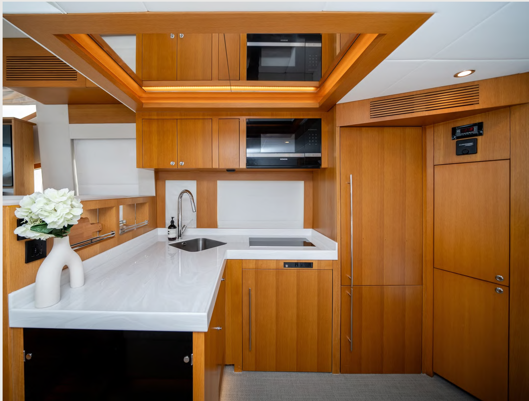
Left — Before Refit Above — After Refit