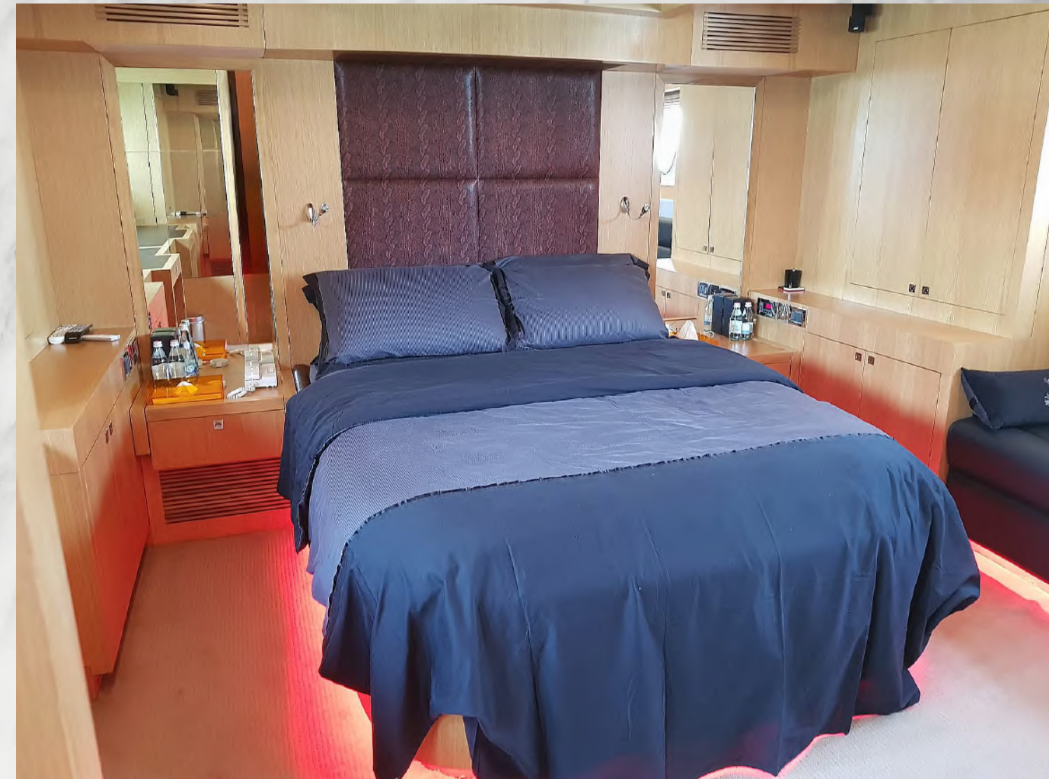
Above — Before Refit Left — After Refit