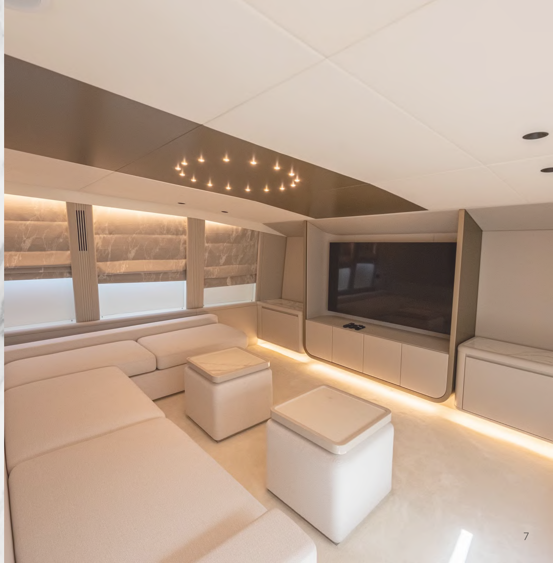
Right — After Refit