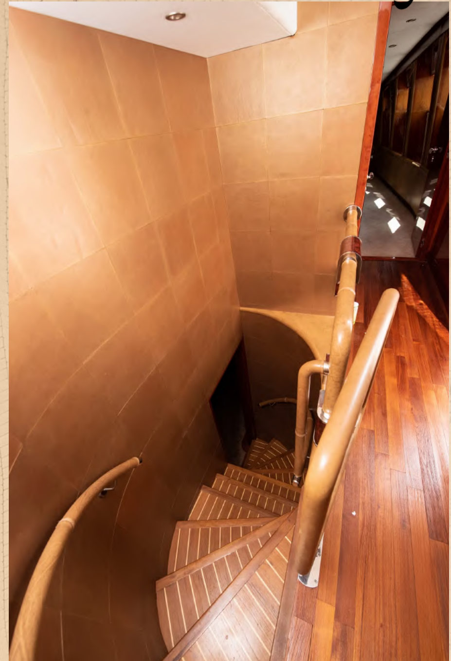
Left Picture — After refit