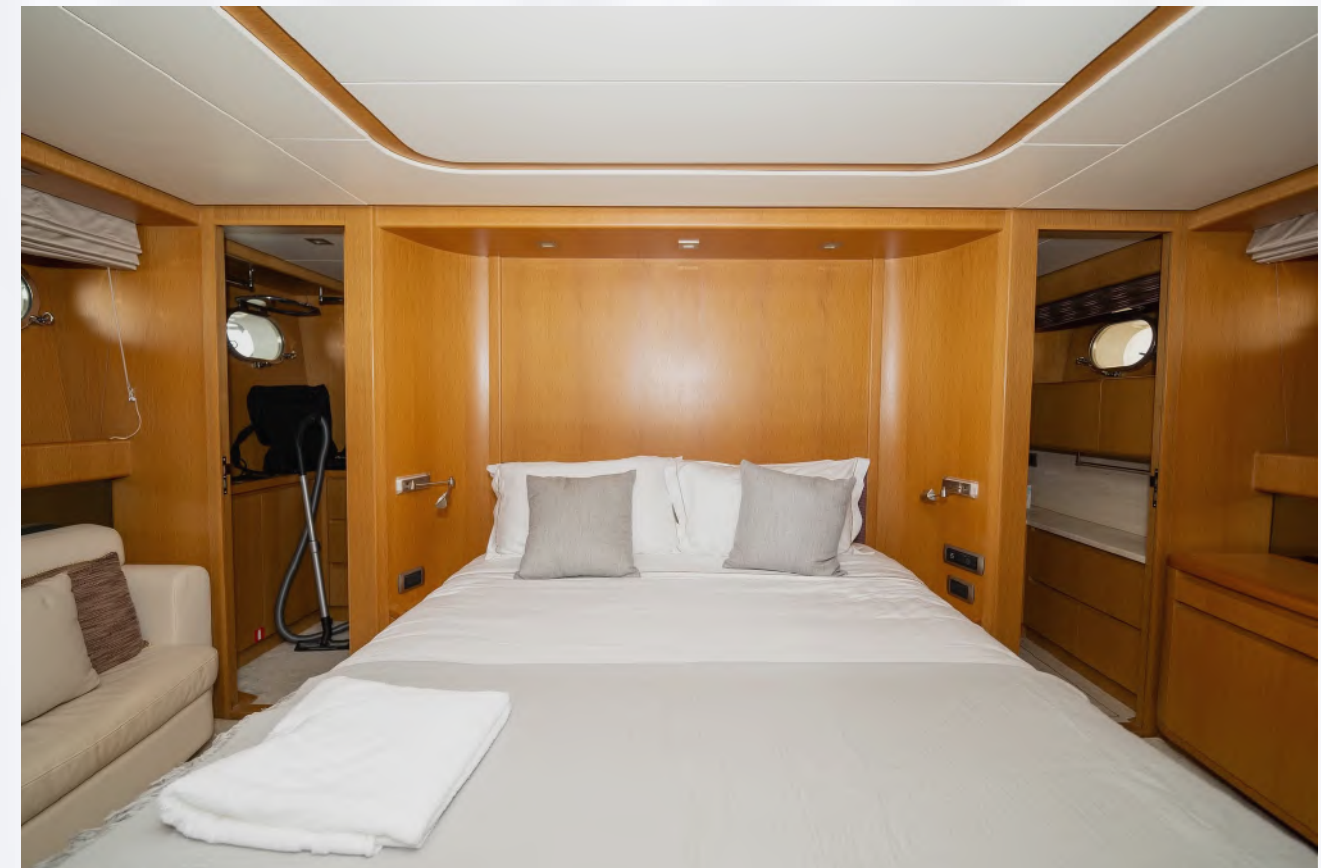
Above Picture — Before Refit Left picture — After Refit