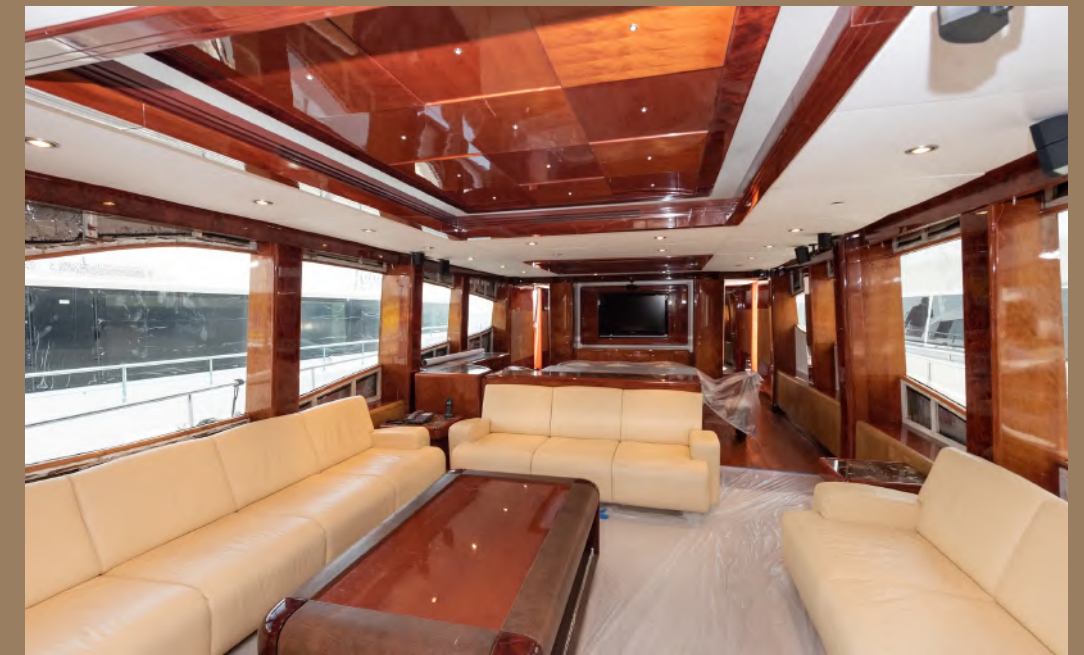
Above Pictures - Before Refit Left Pictures - After Refit