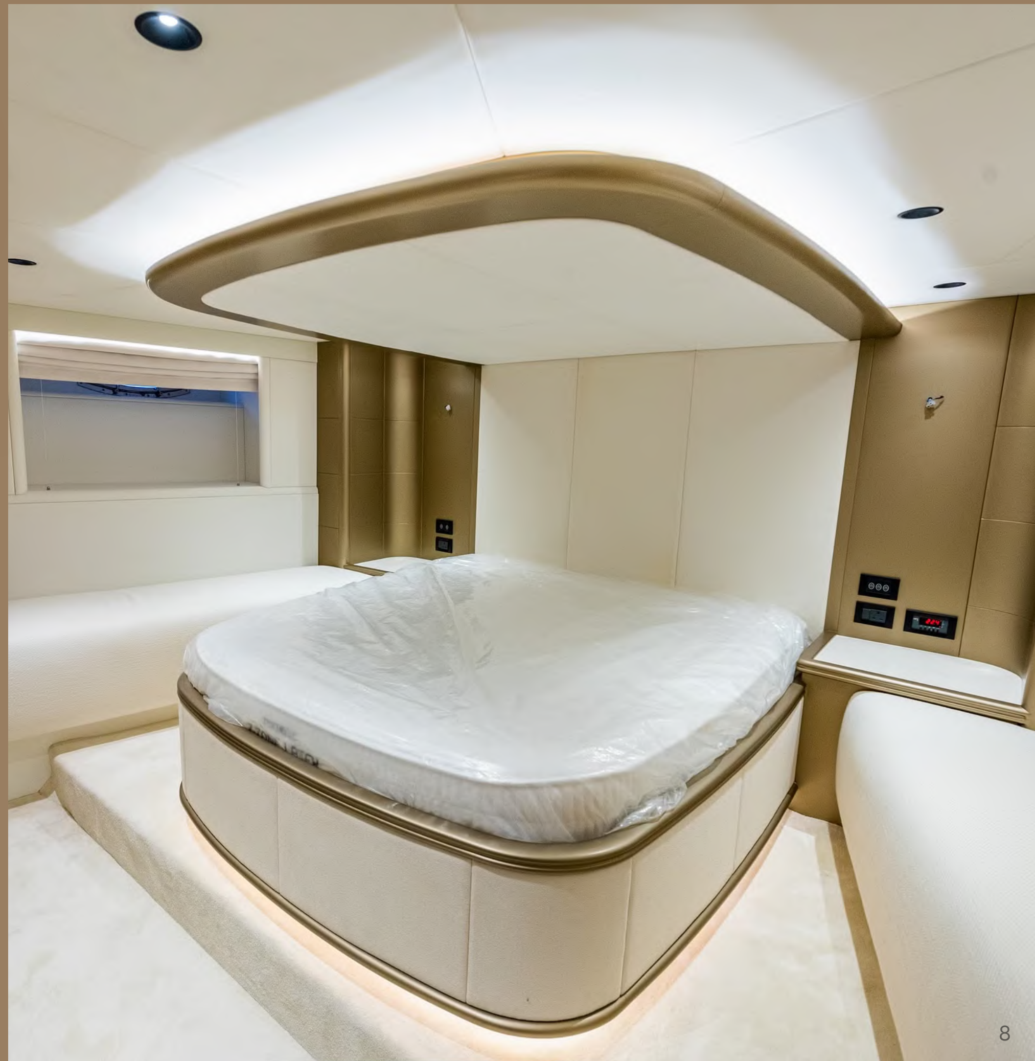
Above — Before Refit Right — After Refit