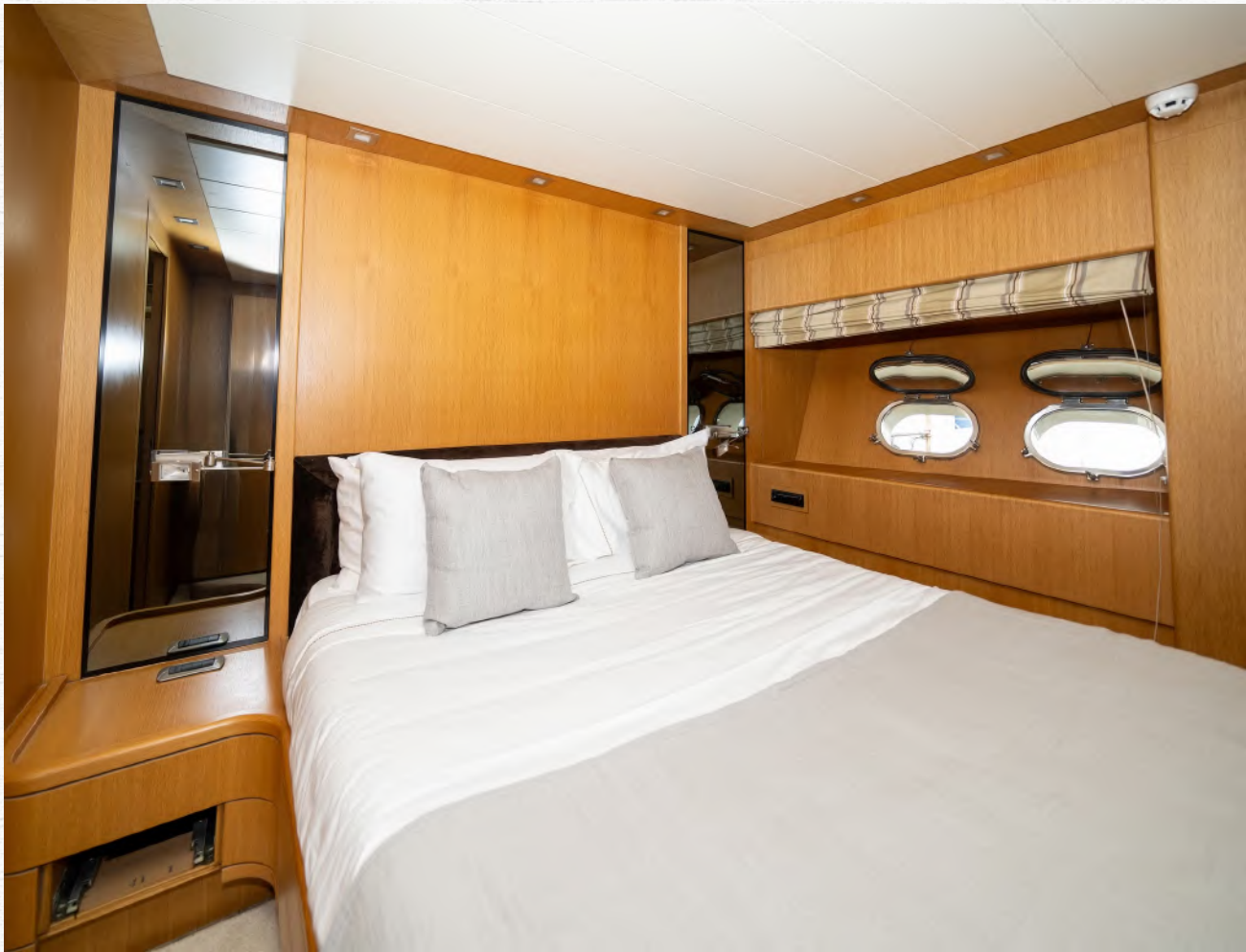
Below Picture - Before Refit Left Picture - After Refit