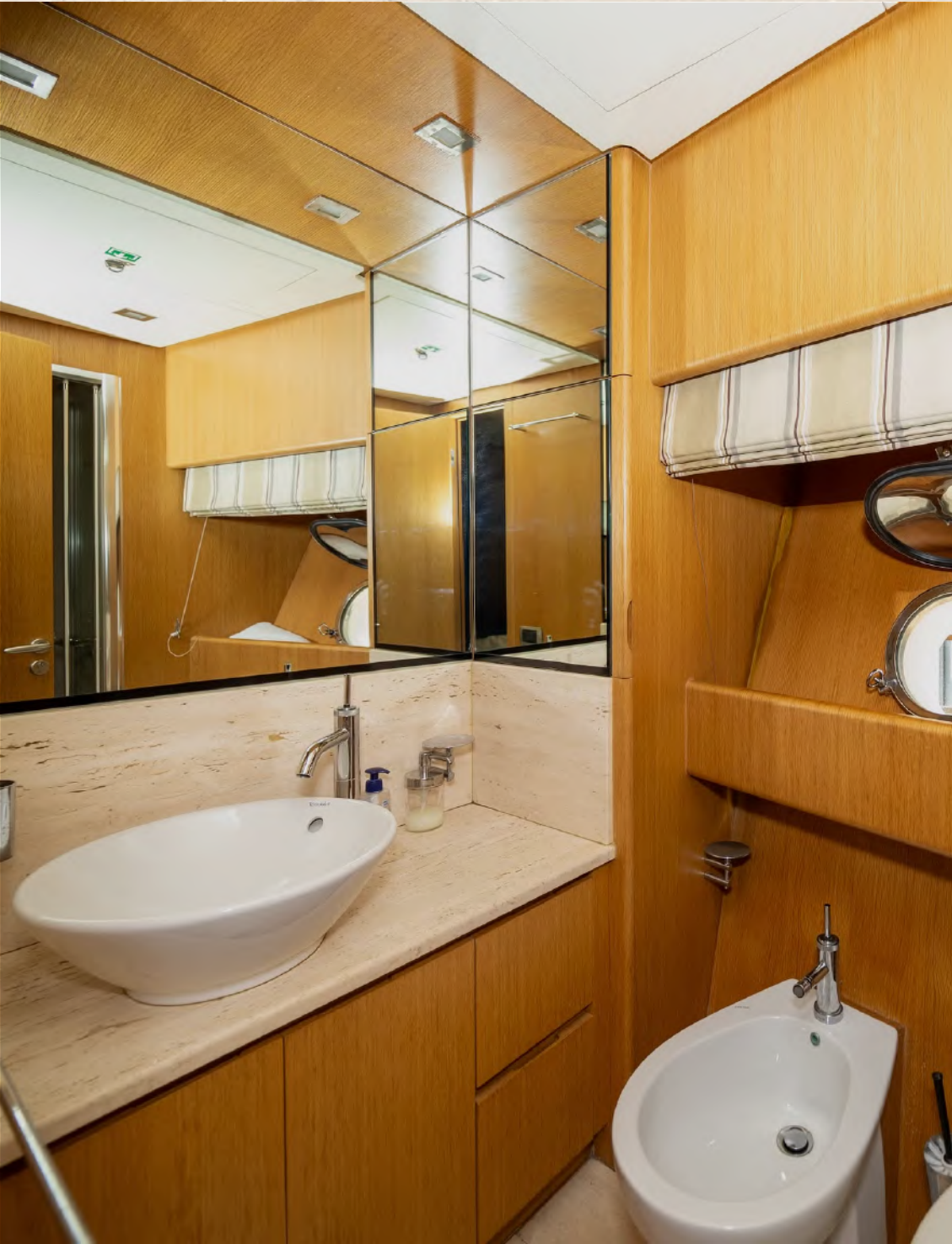
Below Picture - Before Refit Right Picture - After Refit