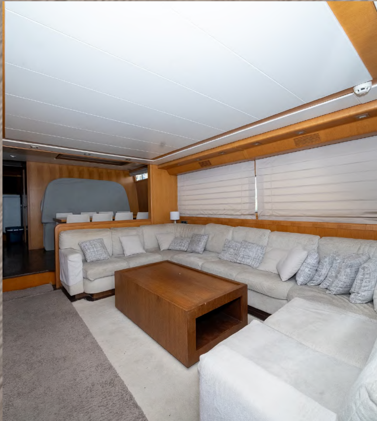
Left Picture — Before Refit