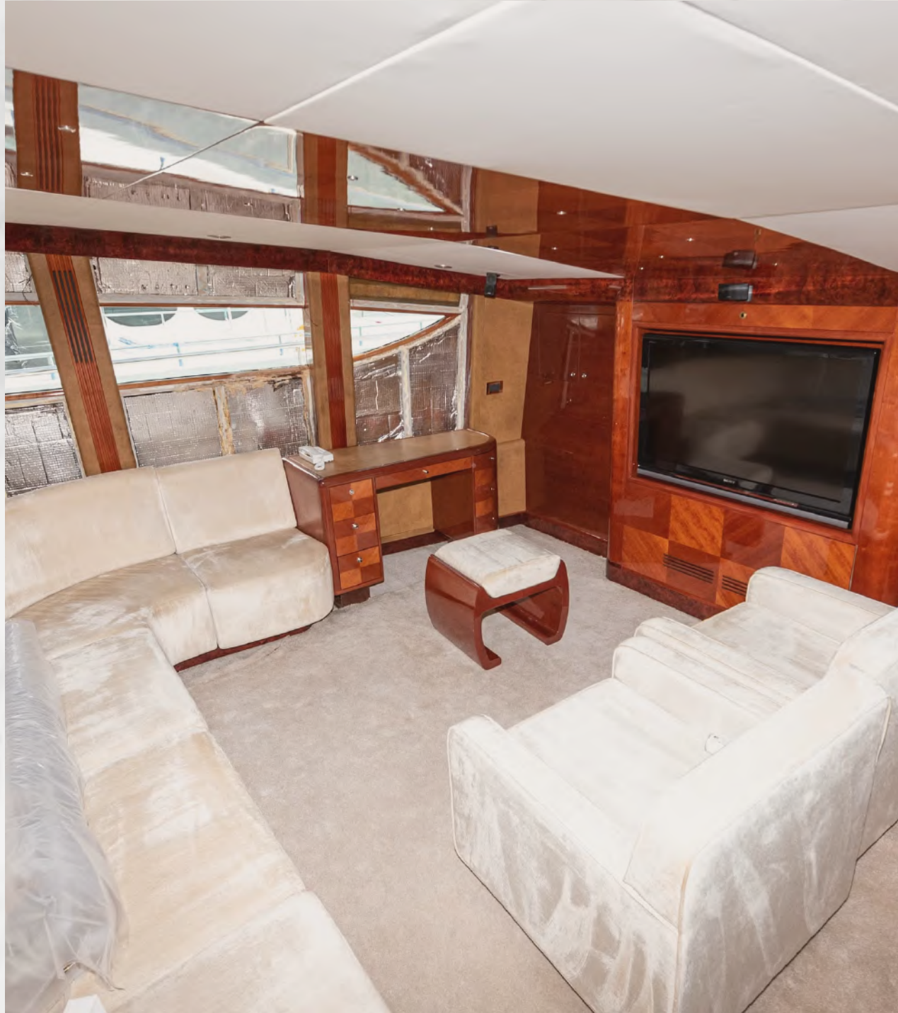
Above — Before Refit