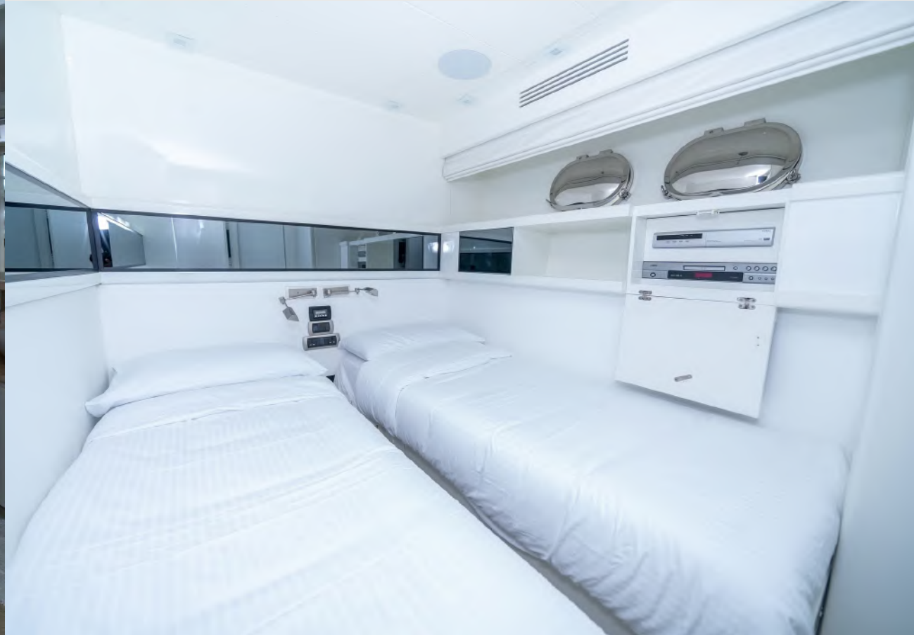
Guest Cabin with sliding beds